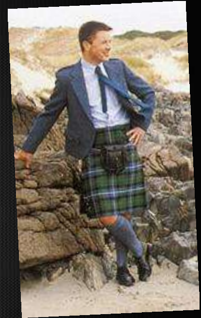
Scottish national costume

– consists of a kilt, knee-length woolen socks, a cap and a sporran