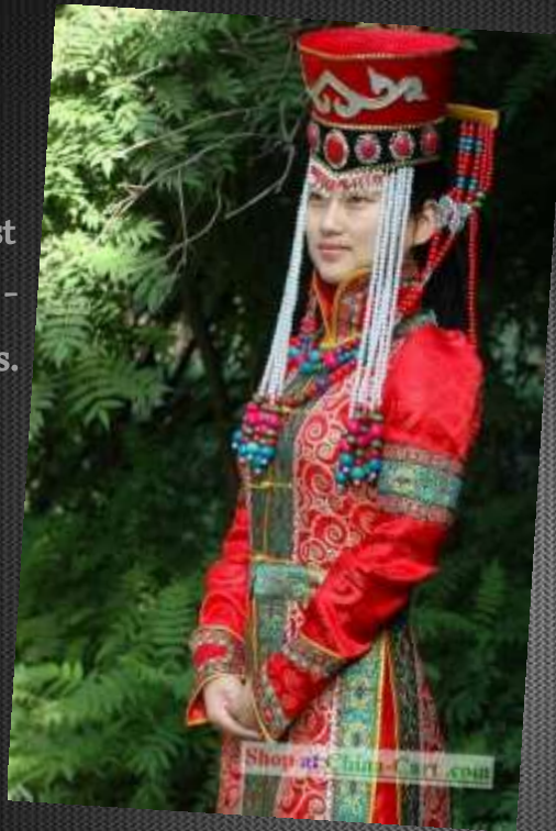
Chinese traditional costume

Costumes reflect the style of a past time. They aren't seen very often - in the theatre, on special occasions.