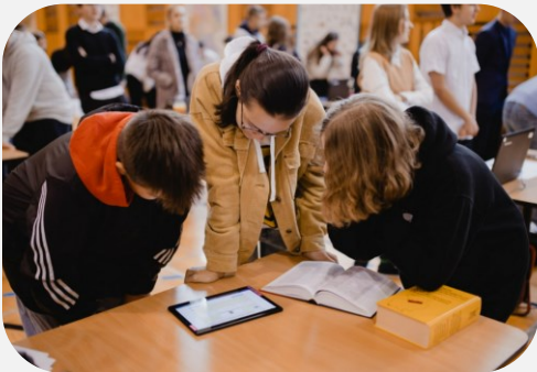
Organization of a linguistic competition for primary schools - Gate of languages opened