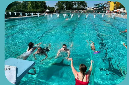
Course of movement activities