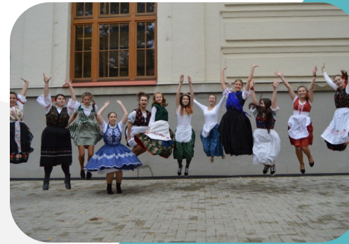
Day of the Slovak traditional clothes