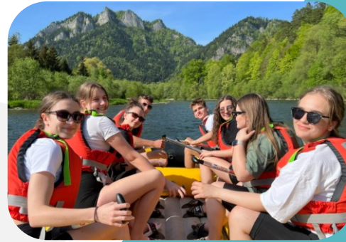
Life and health protection course