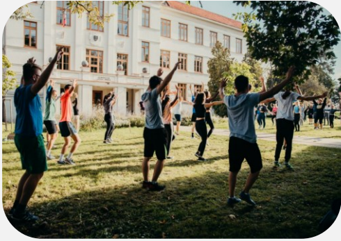
Sports day in our school